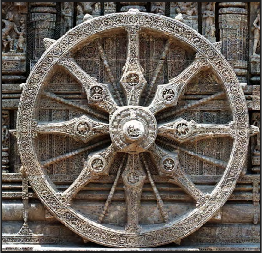
A Dharma Wheel symbolizing the Noble Eightfold Path, at the Konark Sun temple in Odisha, India.